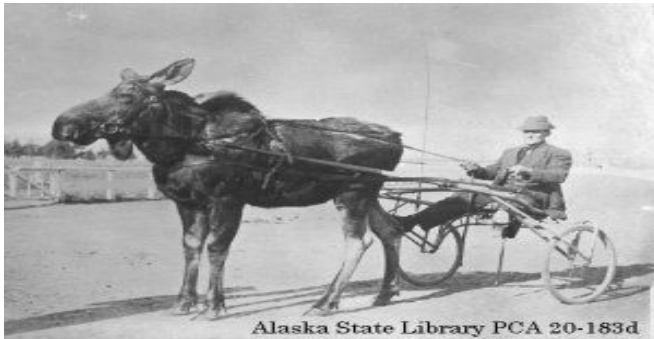
Alaska State Library PCA 20-183d

FREE FOR MOM & A CARNATION; WITH THE FAMILY